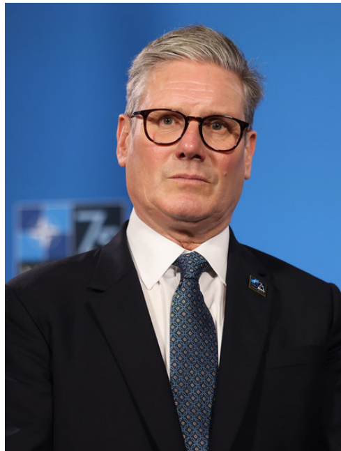
UK Prime Minister Keir Starmer

ing those of Great Britain. It is to state categorically, however, that the interests of the British Empire, are not those of the United States Republic. The differences are clearly illustrated by two passages from the Feb. 20 editorial pages of London’s The Economist , “How Europe Must Respond as Trump and Putin Smash the Post-War Order.”