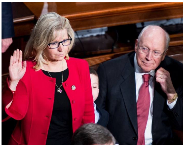
"A vote for Donald Trump is a vote against the Constitution." Liz Cheney stands next to her father, Dick

In an October 15, 2024 press release issued by the U.S. Congress Committee on House Administration, it was announced that the Chairman of the Subcommittee on Oversight, Barry Loudermilk (GA-11), "obtained never-before-seen correspondence between January 6 Select Committee Vice-Chair Liz Cheney, and Cassidy Hutchinson." Hutchinson, a former White House aide who had served as assistant to Chief of Staff Mark Meadows during the first Trump administration, gave