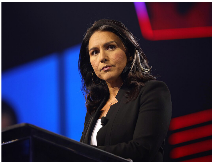
Tulsi Gabbard.

was “unprovoked.” She has expressed skepticism about the campaigns to engineer military confrontations with Iran, Syria, and China. The response from the war party has been childishly heavy-handed, with such neocon luminaries as Hillary Clinton and John Bolton suggesting that she is a “Russian asset.” It is difficult for “chickenhawks” with no military service record to convincingly smear Gabbard, a combat veteran who is currently a Lieutenant Colonel in the U.S. Army Reserve, as some sort of traitor. That, however, does not stop media organs such as Newsweek , AP and the London Economist and Guardian from repeating the insinuations. On June 19, 2022, Gabbard said in a speech before the Western Conservative Summit, “To protect our loved ones, to protect our children, to protect our world, we have to—we are talking about an existential threat—we have to stand up to these cowardly warmongering politicians who exist in both parties now.” Is she willing to stand up to the “war party” as President Trump’s Director of National Intelligence? The Liars’ Bureau prefers that she not have that opportunity.