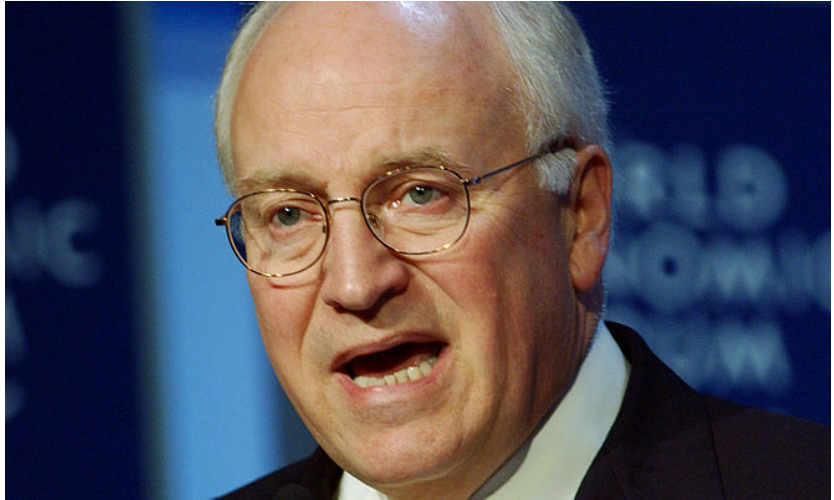
“Simply stated, there is no doubt Saddam Hussein now has weapons of mass destruction.” Dick Cheney

If one wants to know why the British establishment—members of whose intelligence agencies, such as “former” British intelligence agent Christopher Steele, and his controller, former head of British Intelligence (1999–2004) Sir Richard Dearlove, played such a central role in Russiagate—would now be so heavily involved, as a foreign power, in attempting to block the appointments of Patel and Gabbard, it is often helpful to go to the unofficial organ of the British establishment, the London