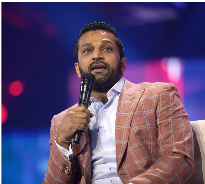
Kash Patel.